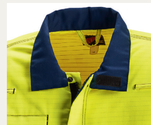
Hook-and-loop closure option on collar

This spacious, high-visibility work jacket features a non-sparking YKK® front zip. The sleeves are designed with pre-bent elbows for a more contoured fit and ease of movement. Major seams are triple-stitched and stress points are bar-tacked for strength. Reflective striping is strategically placed for increased visibility and safety.